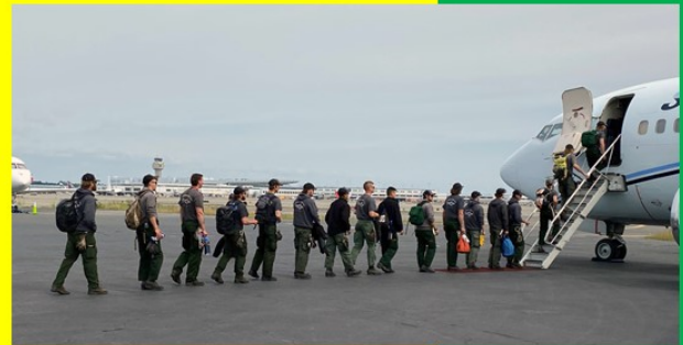
The Pioneer Peak Interagency Hotshot Crew boards a National Interagency Coordination Center jet on Tuesday at Ted Stevens International Airport in Anchorage enroute to Boise, Idaho to assist with wildfire management in the western United States.