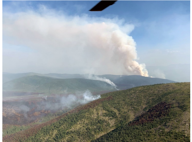
Activity on northeast corner of Munson Creek Fire on Tuesday, July 20 during helicopter reconnaissance flight.